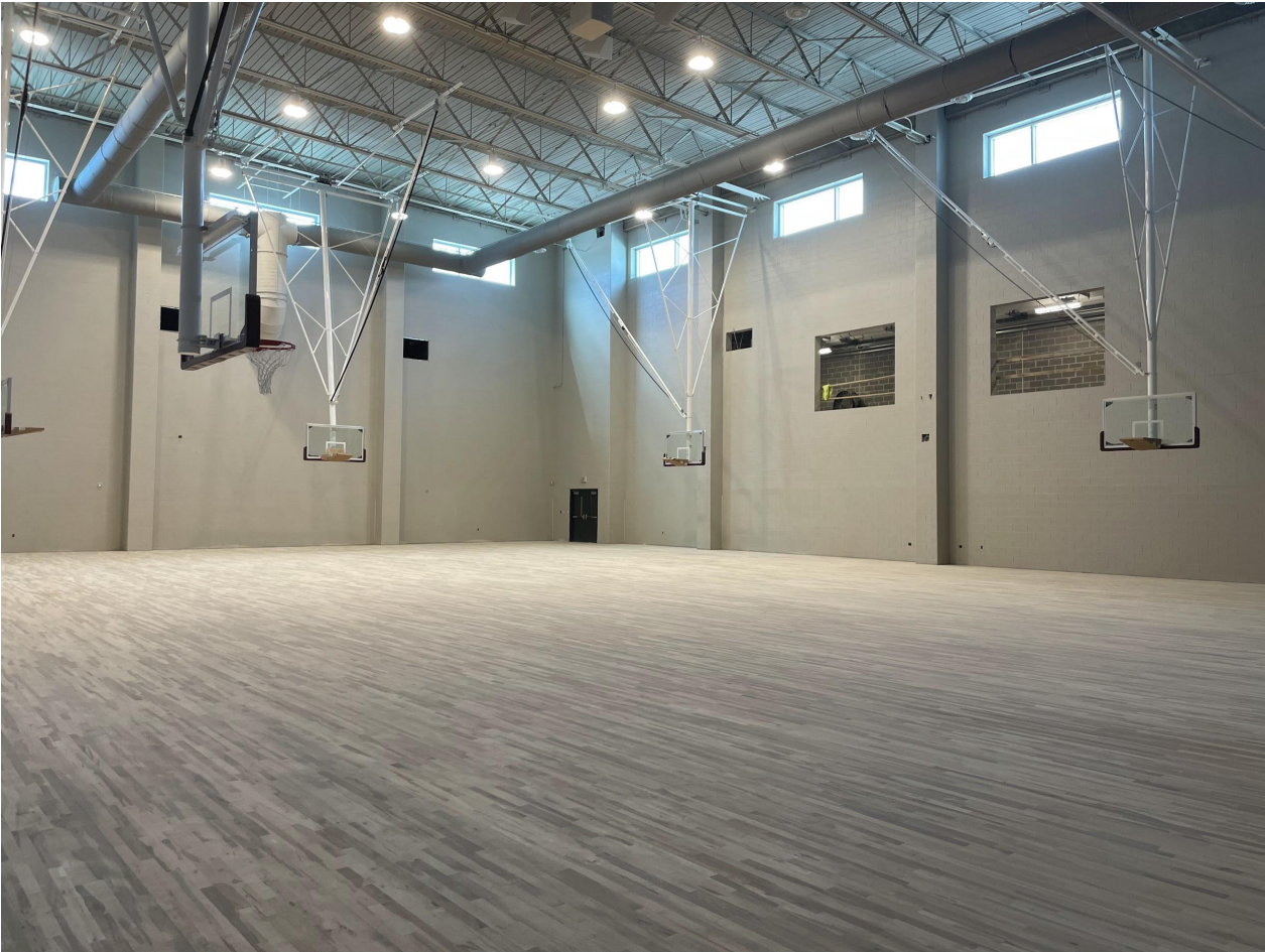
Dance Gym (Both Floors Unfinished)