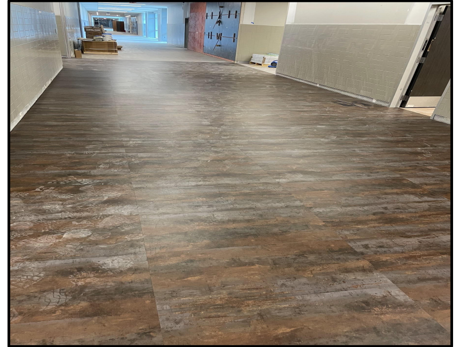
Vinyl Flooring Install Beginning on 3rd Floor